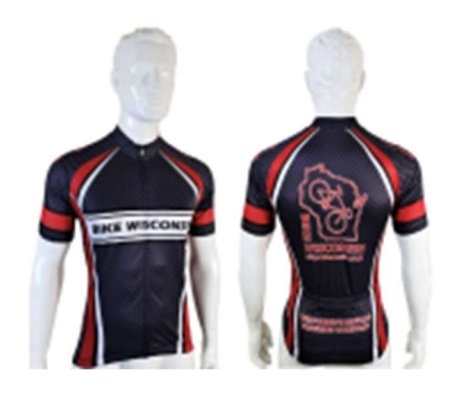
Bike Wisconsin Jerseys - $99.99 ea.

All merchandise items will be delivered during the tour.